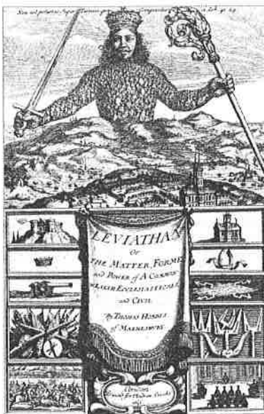
Cover art from Leviathan .